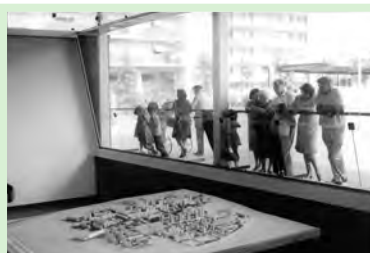
J. Biaugeaud (archives de la Caisse des dépôts et consignations)